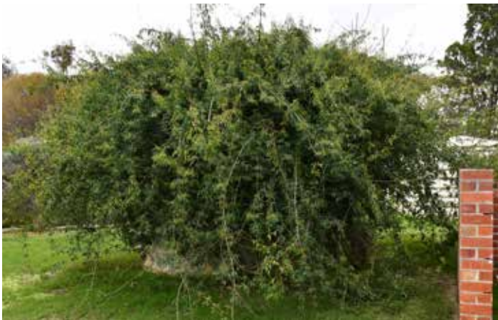
26 May 2021. Some severe discipline needed here. Looks like it wants to take over the world.