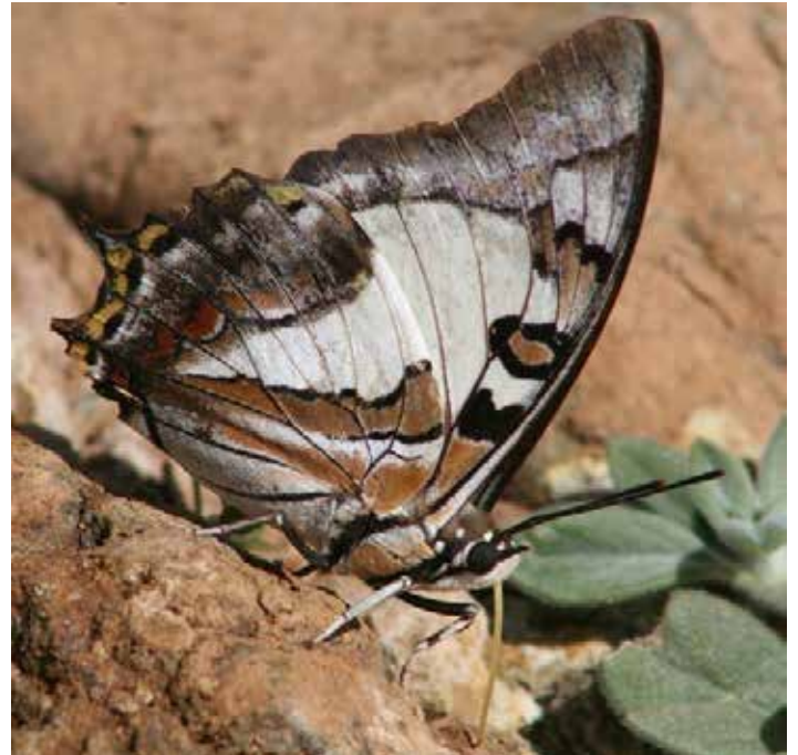
Polyura sempronius Tailed Emperor.