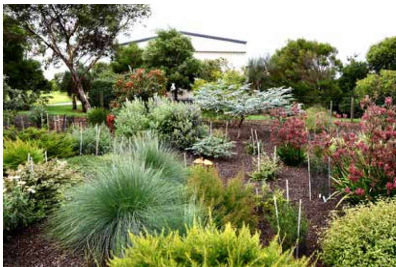
One of the gardens which our group will be visiting.