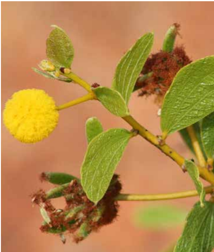
Acacia retivenea subsp retivenea .