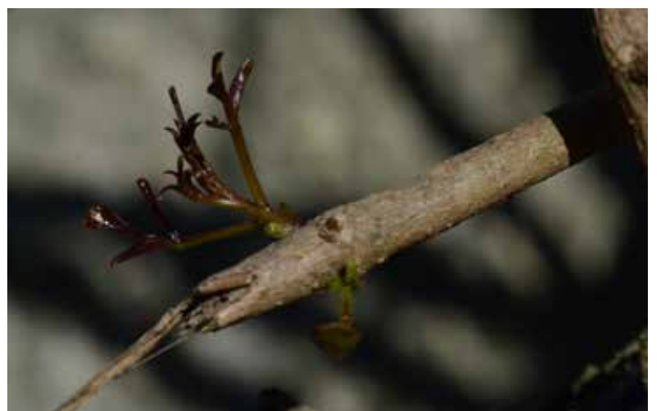
8 September 2021. Signs of life. New shoots appearing.