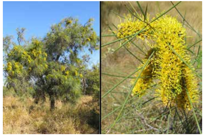
Hakea lorea . Corkwood.