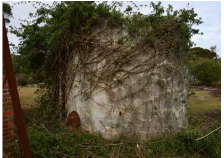
26 May 2021. Above and below: Hard pruning but not quite a massacre.