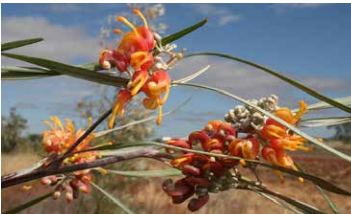
Grevillea refracta Silver leaf Grevillea.