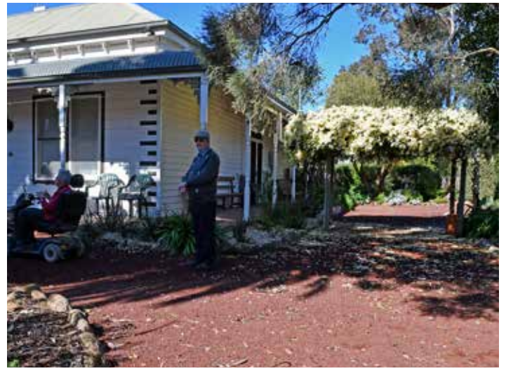
Pandorea pandorana massed flowering over an arch on Graeme and Libby Gulline's property.