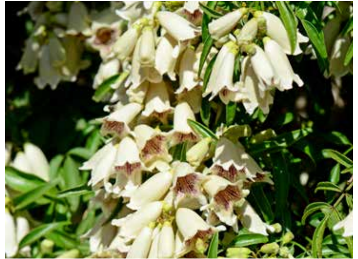
The flowers of Pandorea pandorana covering a tank on the Goods Property. Note: these flowers have red striped centres.