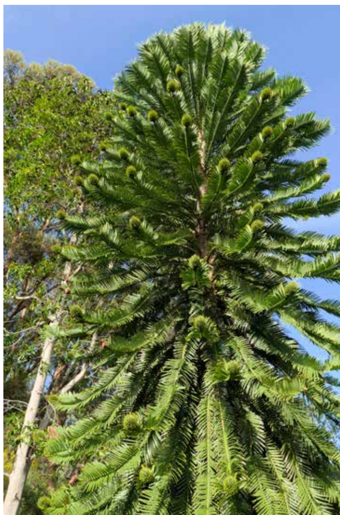
Wollemi Pine- Wollemi nobilis growing in Prue and Will Pyke's garden.