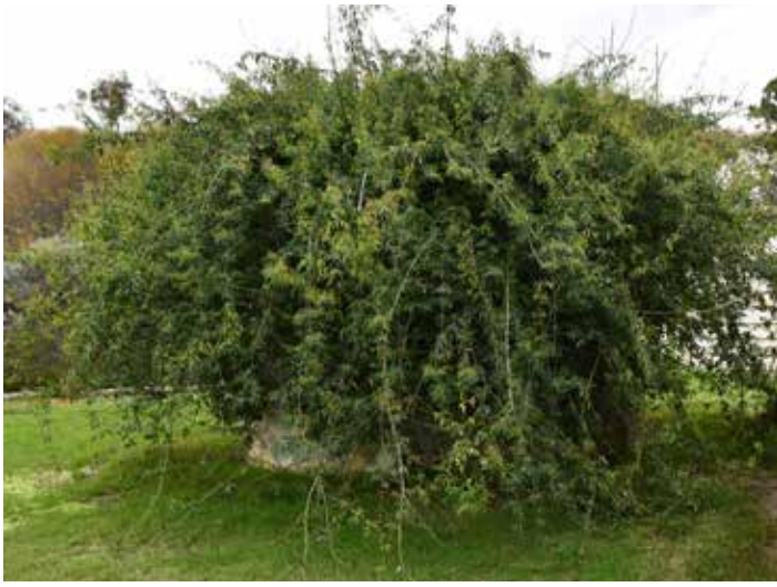
25 May 2022. As wild as ever, why did I bother.